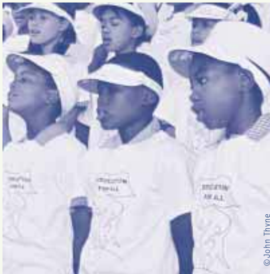
Children at Khomasdal and St. Andrew's Primary Schools in Windhoek, Namibia, sing an education song during EFA Week.

More about EFA Week on www.unesco.org/education/efaweek